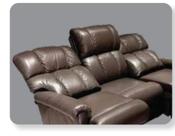
Independently adjust the left and right backs and legrests

DIMENSION: 60" W x 38.5" D x 41.5" H | Full Extension 63"