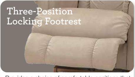
Provides a choice of comfortable positions that lock in place for added safety and support.