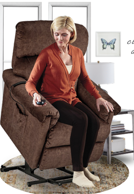
Legrest will not close when encountering an object in its path,