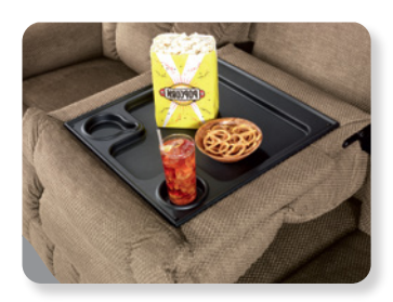
Drop-down table [T35/P35]