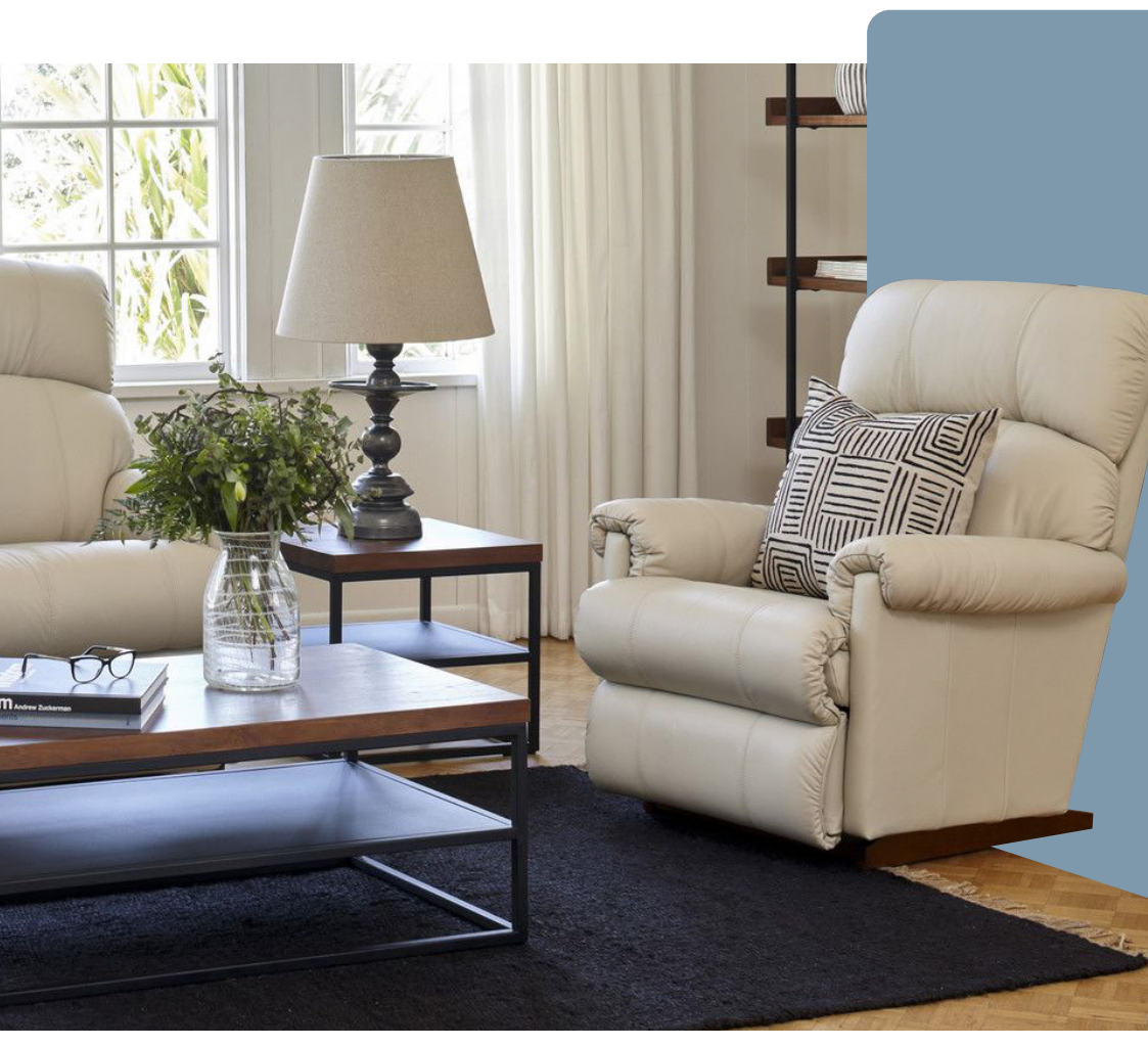
The Eden is the popular La-Z-Boy® range, and it is easy to see why! You can be assured you won't compromise on style or comfort as the Eden caters for every member of your family.