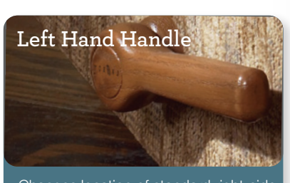
Changes location of standard right-side handle to left-side sitting.