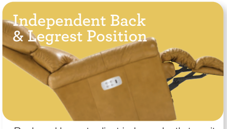
Back and legrest adjust independently to suit your reclining preference.