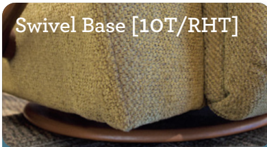
Swivel Base [1OT/RHT]

With our sleek and ergonomic brushed nickel arc handle design, reclining is more stylish than ever.