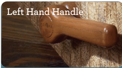
Left Hand Handle

Changes location of standard right-side handle to left-side sitting.